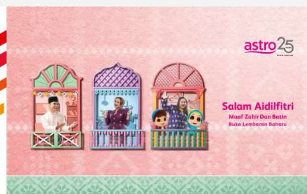
Now you can celebrate a new chapter together with Astro