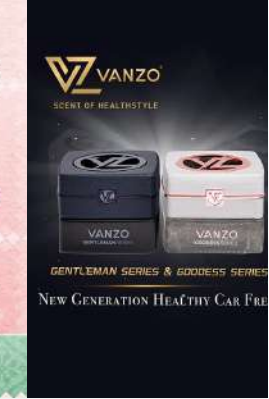
VANZO, the first I by Hong Kong Su