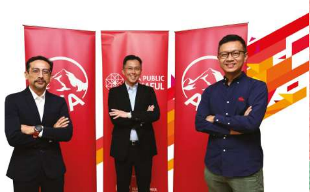
Heightened insurance awareness leads AIA to expand workforce and digital ambition