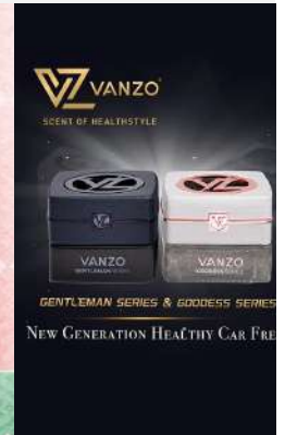
VANZO, the first in its class by Hong Kong Sun