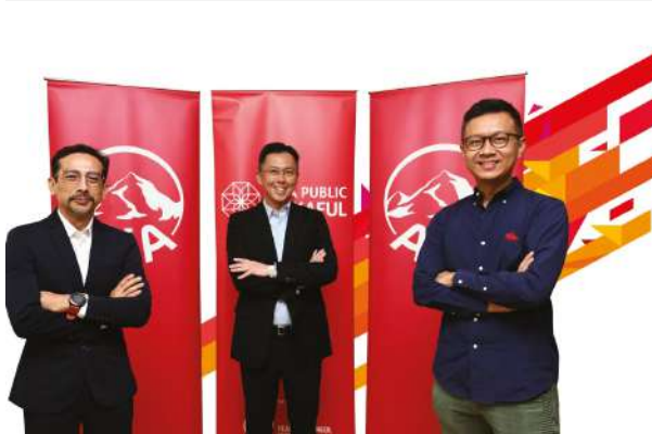
Heightened insurance awareness leads AIA to expand workforce and digital ambition