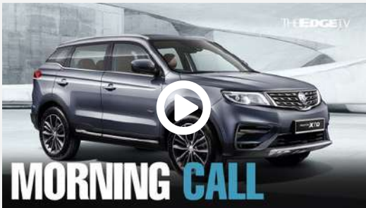
10 May | 06:30am Morning Call, F... MORNING CALL:10/05/21