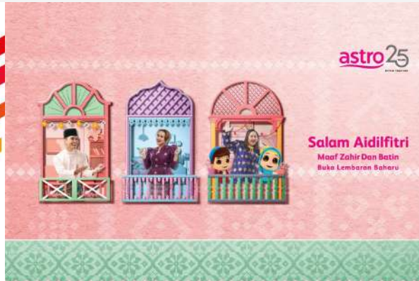
Now you can celebrate a new chapter together with Astro