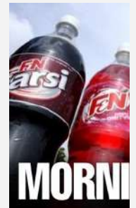
07 May | 06:30 MORNING